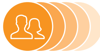
User Community Task Teams (IT, Finance, Engineering, Production, Materials, Service, etc.)

The project will also need an executive sponsor to provide vision, motivation, and conflict resolution (when the team doesn't have the authority to break a stalemate or resource contention issue). Project team participation is seldom a full-time job (except perhaps for the project leader/team leader). Specific tasks will be completed by sub-teams in the individual departments under the watchful eye of task team leaders who report to the project team.